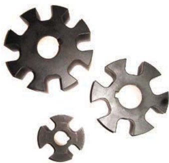
Floating Design, PTFE Coating