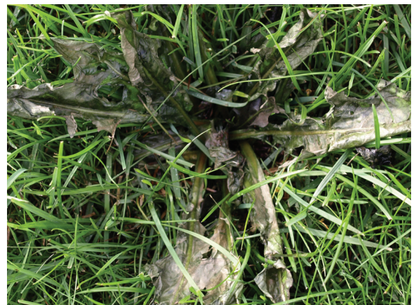
24 HOURS LATER