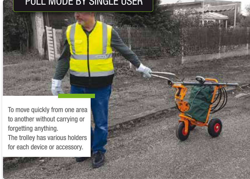
PULL MODE BY SINGLE USER

To move quickly from one area to another without carrying or forgetting anything. The trolley has various holders for each device or accessory.