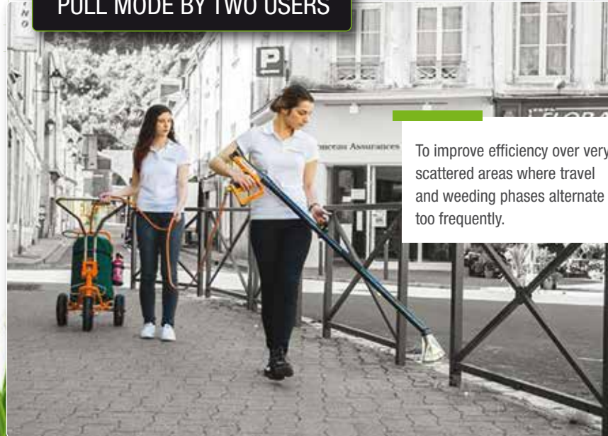
PULL MODE BY TWO USERS

To improve efficiency over very scattered areas where travel and weeding phases alternate too frequently.