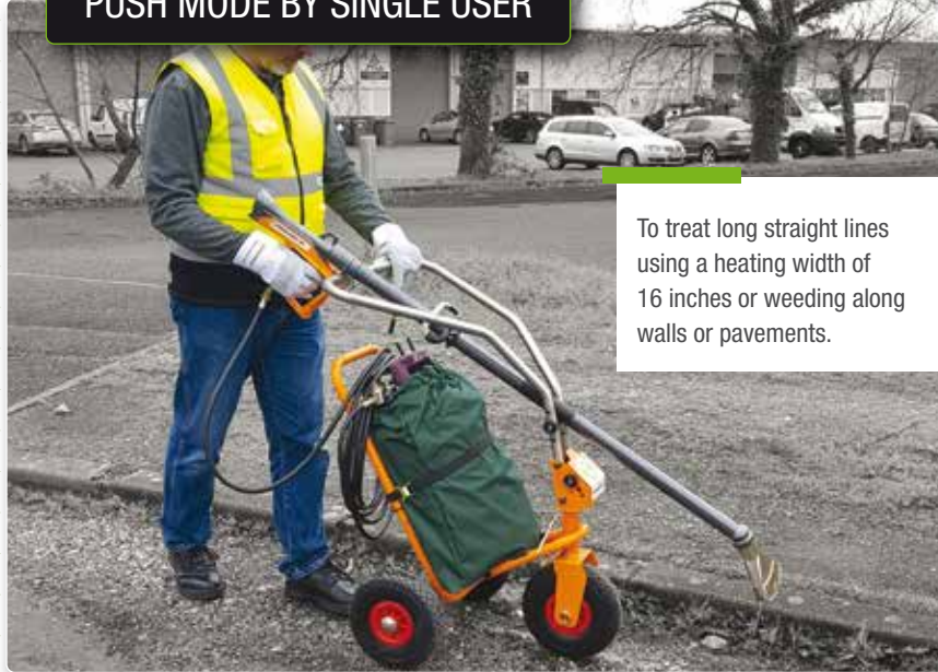
PUSH MODE BY SINGLE USER

To treat long straight lines using a heating width of 16 inches or weeding along walls or pavements.