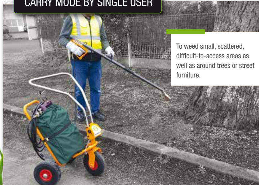
CARRY MODE BY SINGLE USER

To weed small, scattered, difficult-to-access areas as well as around trees or street furniture.